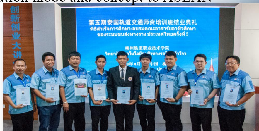
第五期泰国轨道交通师资培训班结业典礼现场 The closing ceremony of the fifth Thailand rail transit teacher training class

Liuzhou Railway Vocational Technical College has further promoted regional cooperation with Russia and ASEAN, and explored the development mode of vocational education to match with China's rail transit industry and technology “going out”.