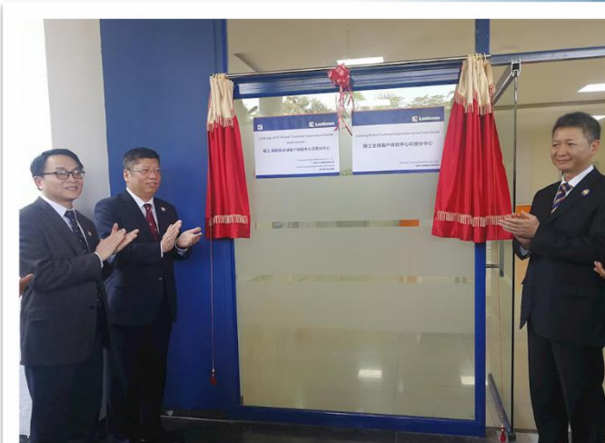
“柳工-柳职院”全球客户体验中心印度分中心落地Liugong - LVTC Global Customer Experience Center India branch was established

2. The experience center is not only responsible for Liugong global dealers and service personnel training, but also carries out talent training, skill competition, science and technology R&D, etc. according to the industry development needs of Liugong.