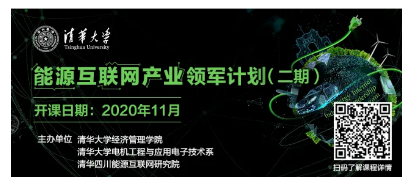
Recruitment of Energy Internet Industry Leadership Program (Phase II)