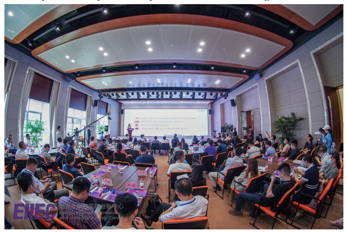
▲ Event site