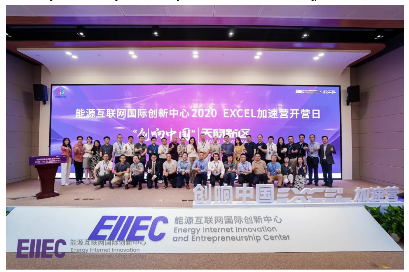
▲ Group photo of the guests at the scene

At the end of the event, the offline participants went to the planning hall of Tianfu New District to learn more about the planning blueprint of Tianfu New District and the advantages of industrial clusters, drawing a successful end to the opening day activities, further accelerating the development of energy innovation companies and helping Tianfu New District builds a new chapter of the new pattern of innovation and entrepreneurship.