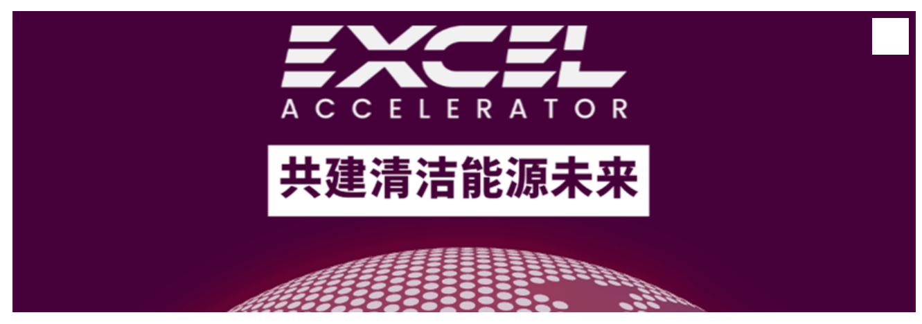
Recruitment details of EXCEL acceleration camp